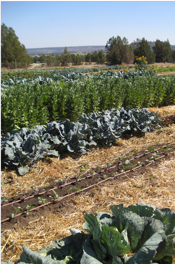
Figure 5 Diverse mixture of vegetable crops on an organic farm

http://www.extension.org/pages/18634/use-of-tillage-in-organic-farming-systems-the-basics . This article describes the benefits and drawbacks of different forms of tillage and considerations when making decisions about tillage and tillage implements. Conservation tillage and no-till are also discussed briefly.