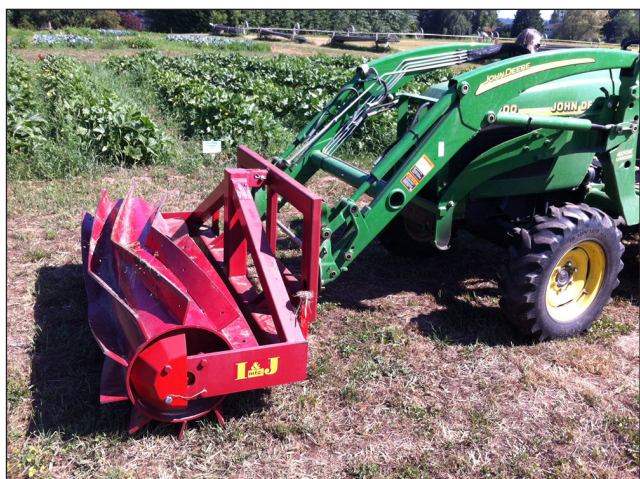
Figure 6 Roller crimper

Biorationals: Ecological Pest Management Database (ATTRA) https://attra.ncat.org/attra-pub/biorationals/ . This tool provides information on organic and other pesticides as well as preventive measures for common pests; allows searches by pest, trade name, or active ingredient; has links to labels and manufacturer information; and notes which materials are listed by OMRI (Organic Materials Review Institute). Because OMRI listings are frequently updated, organic producers should check with their certifiers prior to applying any materials to their crops or livestock.