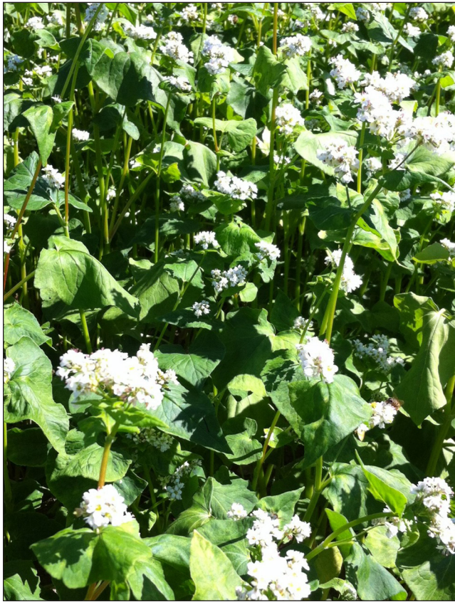
Figure 4 Organically managed buckwheat cover crop.

cover crops for different regions, seasons, and objectives; and advantages, drawbacks, planting rates and methods for each cover crop species. Detailed chapters cover 20 of the most widely used cover crops.