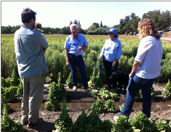
Figure 2 NRCS staff and producers discuss organically managed lettuce seed production

A producer sends their completed OSP along with a base payment to the certification agency. If all farm management information, field maps, and input ingredient information is complete, the certification agency reviews the OSP and then assigns the file to an inspector. If it appears the operation does not meet organic regulations, the certification agency will typically discuss areas of noncompliance with the operator and outline steps that need to be taken before the organic certification process can move forward. Once certified, organic producers must update their OSP throughout the year.